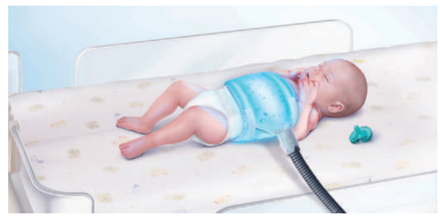
BiliTx can be used in any hospital setting, including with warmers or bassinets.

BiliTx can be used alone or combined with conventional overhead lights to provide dual-surface phototherapy for the most severe hyperbilirubinemia cases.